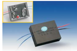
SM1224-1A Power Transformer Module