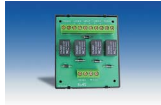
ILM-200 Interlock Module