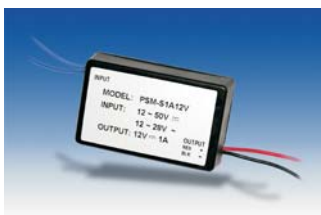
PSM-S1A12V Waterproof Switching Module