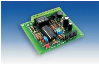
ABD-110 Timer Board

The ABD-110 timer allows for timed or latched functions of the relay. In timer mode, the unit can in a x1 mode, (the timer is set between 1 and 60 seconds.) Or a x10 mode (the timer is set between 10 and 600 seconds.) In latch mode, the timer does not apply, and the relay will remain energized unit a short is applied between the reset terminals.