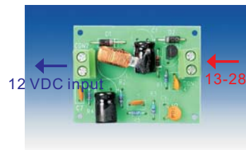
SM1228 Power Transformer Module