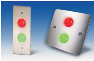
Door Status Indicator