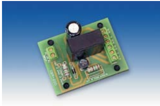
DBR-200 Relay Board

The DBR-200 Relay module is worked when power input then contacts will change over from N/C (Normally Close) to N/O (Normally Open)