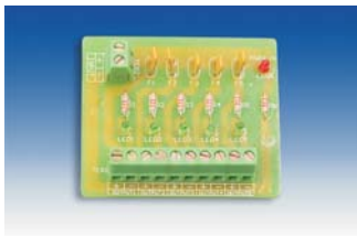
GPD-3015 Voltage Distribution Board

The ABD-110 timer allows for timed or latched functions of the relay. In timer mode, the unit can in a x1 mode, (the timer is set between 1 and 60 seconds.) Or a x10 mode (the timer is set between 10 and 600 seconds.) In latch mode, the timer does not apply, and the relay will remain energized unit a short is applied between the reset terminals.