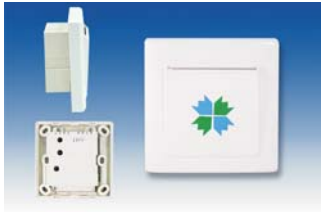
GH-803-110J-BG Power Consumption Switch

Direct use of card (ISO Card Specification) can be installed in the room's main electrical switch, a 20 sec. Gap after card take out, ensures that the customer room is safe.