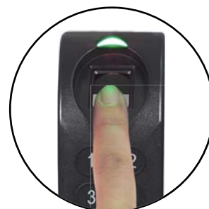
Fingerprint Scanner for Secure and Easy Access